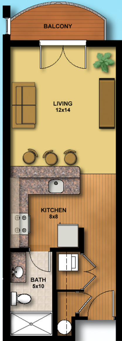
Unit D *406 S.F.